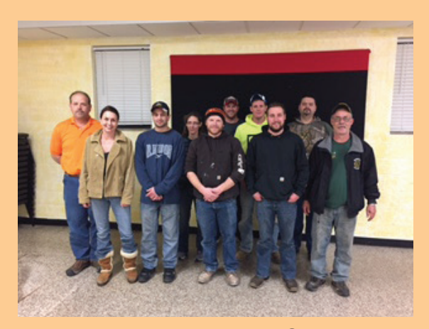
Local 330 New Member Orientation

For any other Vacation Fund questions, including payout information, please call the Laborers' District Council of MN & ND at 651.653.9776.