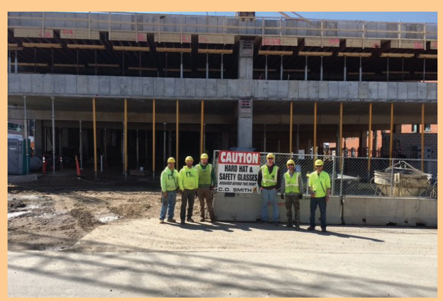
Local 140 Members at CD Smith Parking Ramp Project in La Crosse